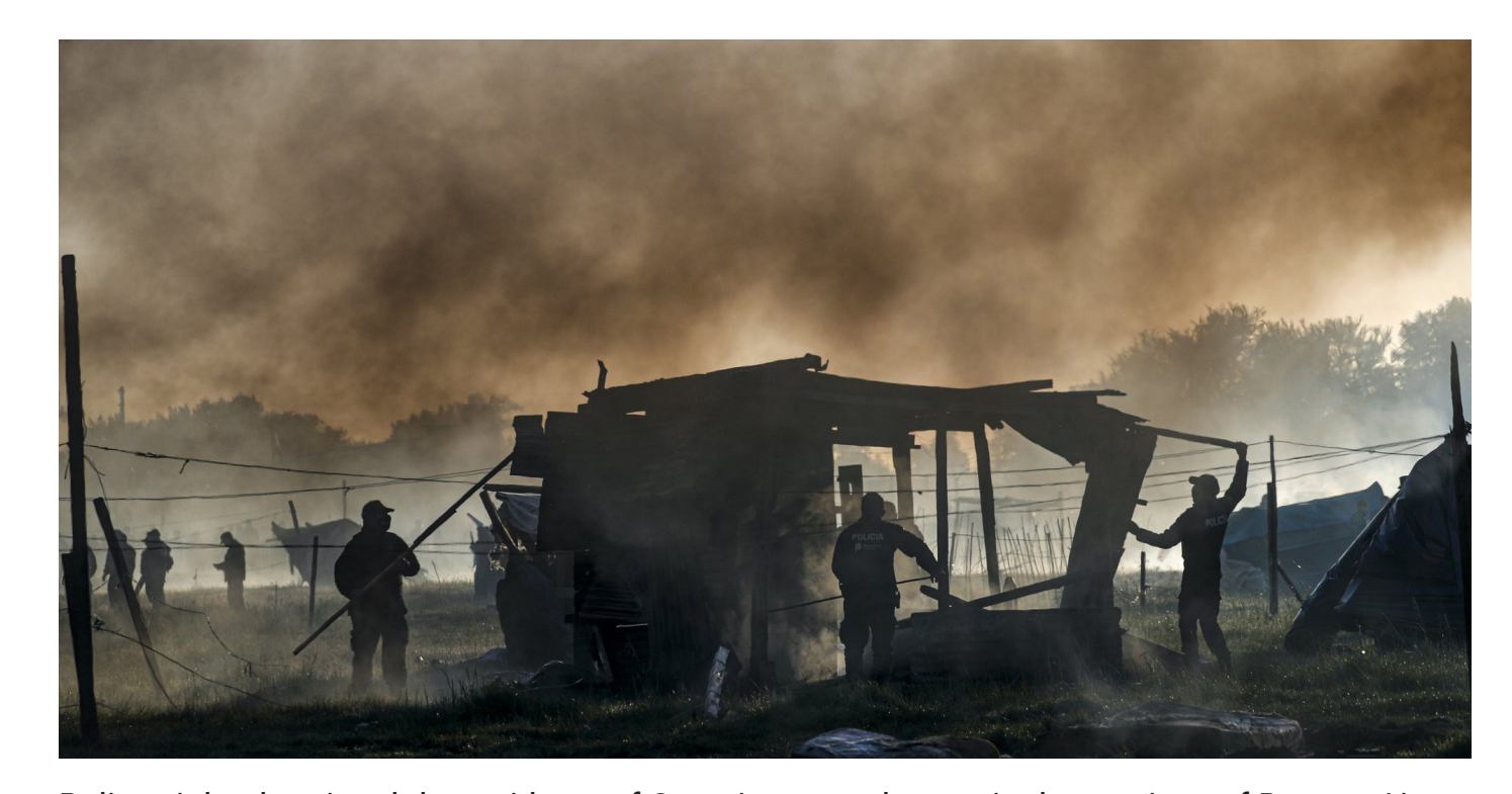
Police violently evicted the residents of Guernica, a settlement in the province of Buenos Aires, Argentina, leaving over 3,000 people in homelessness during a pandemic. October 2020.

In response to a Covid-19 outbreak, the Government of Victoria instituted a police-enforced hard lockdown on nearly 3,000 migrants and refugees living in social housing blocks in Melbourne, Australia, that violated residents' right to housing. August 2020.