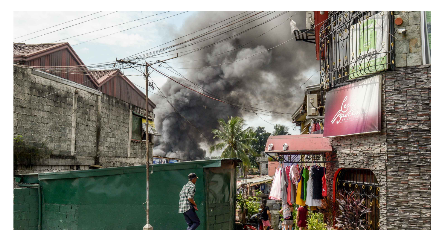
Fires commonly break out in informal settlements due to poor conditions, lack of access to formal electrical grids, and the burning of trash as the sole means of garbage disposal. Manila, Philippines. September 2017.

On a research visit as Special Rapporteur to Seoul, South Korea, Leilani met with residents facing eviction from their neighbourhood, Ahyeon-dong, which was slated for demolition to make way for new high-rises. May 2018.