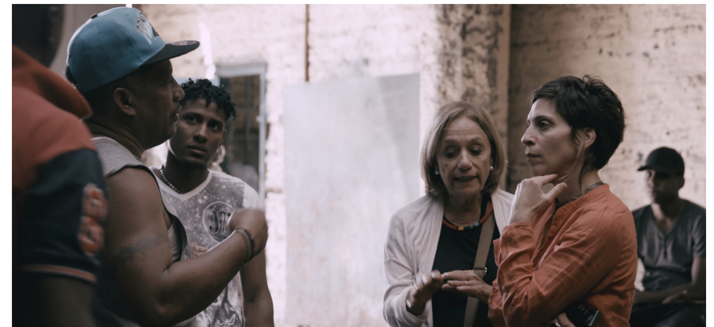
During her tenure as the United Nations Special Rapporteur, Leilani met with Colombian migrants in Santiago, Chile, who were forced to squat in abandoned buildings as a result of unaffordability and discrimination.

In the face of the global pandemic, The Shift partnered with the Open Society Justice Initiative to develop emergency legislation to demonstrate the measures governments must take to protect the right to housing during Covid-19.