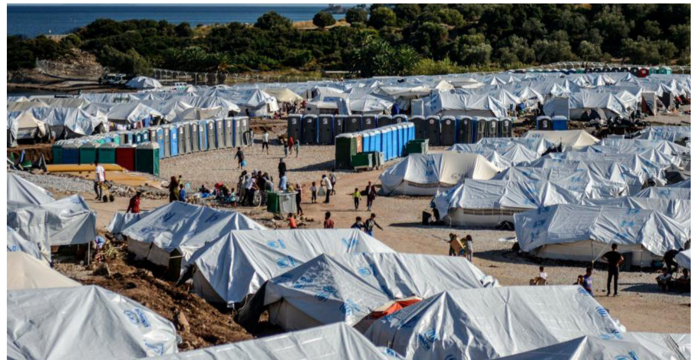
Migrants displaced by fires at the Moria Reception and Identification Centre in Lesbos, Greece, were relocated to Kara Tepe, a temporary camp that fails to meet international human rights standards. October 2020.