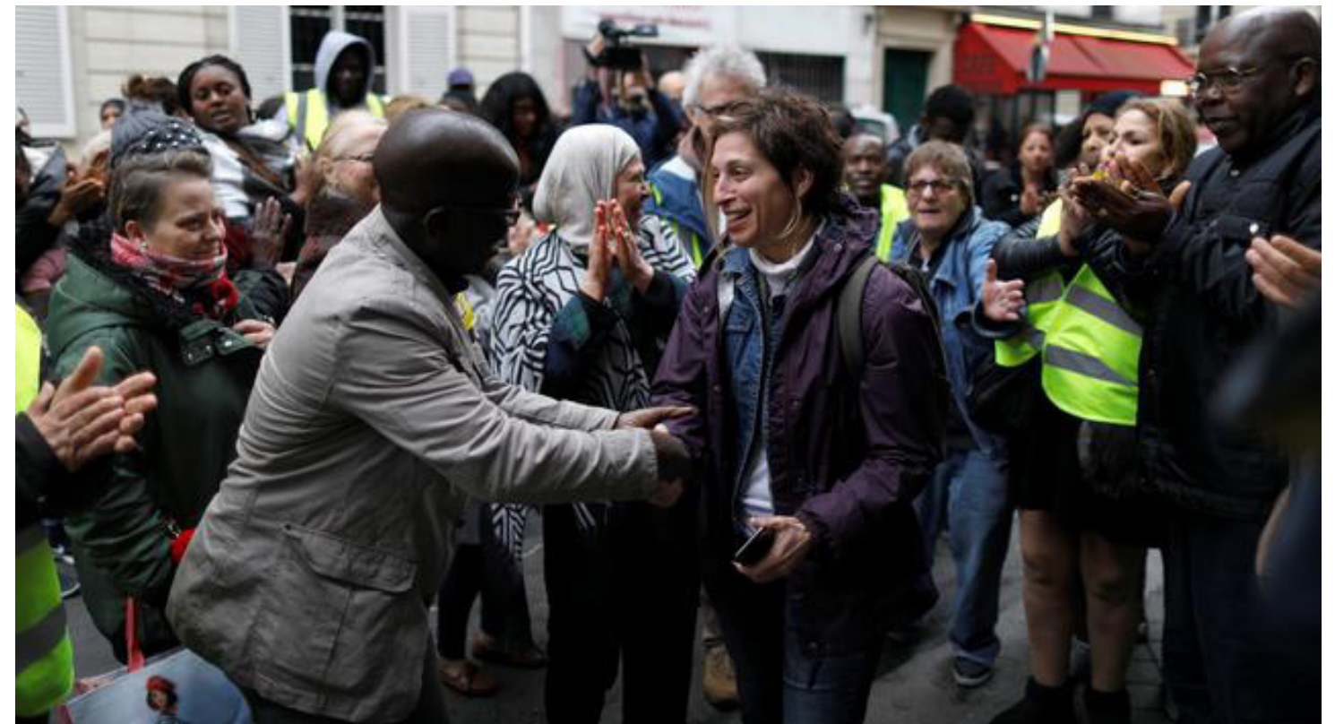
Leilani met with housing advocates outside of a local emergency shelter for migrants and refugees on a research visit to Paris, France. April 2019.

We are a young organization with deep knowledge and vast networks, working at a unique intersection of issues – human rights, housing, urbanism, climate change, and financialization. We have the relevant expertise, experience, and energy required to fight effectively and strategically for safe, adequate, and affordable housing for all in the context of a pandemic and a world hungry for justice.