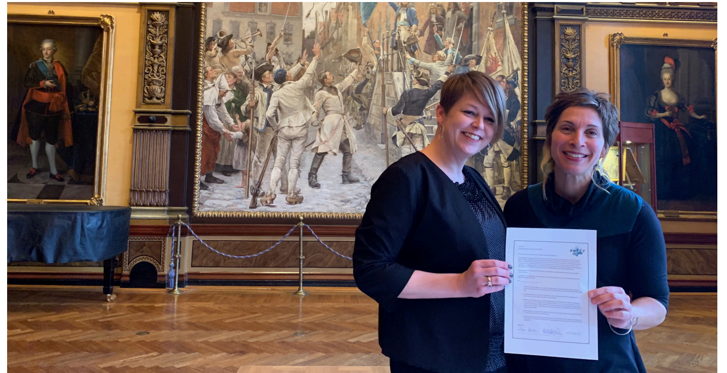
Mayor Katrin Stjernfeldt Jammeh hosted a ceremony at City Hall to celebrate the Swedish City of Malmö's commitment to realizing the right to housing in collaboration with The Shift. March 2019.

Refugees & Migrants: Throughout 2021, The Shift will work with local governments in Greece to develop comprehensive human rights strategies to secure the right to housing for refugees and migrants. This is a collaborative initiative with Open Society Foundations .