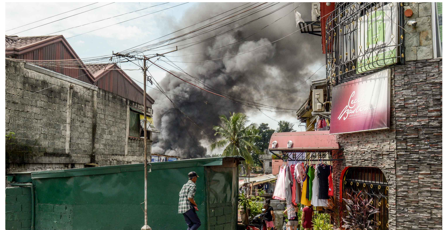
Fires commonly break out in informal settlements due to poor conditions, lack of access to formal electrical grids, and the burning of trash as the sole means of garbage disposal. Manila, Philippines. September 2017.